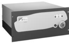
GSI 500W fiber laser device optional 200W, 1000W, 2000W

Taiwan HIWIN brand ballscrew, high precision, good abrasion resistance. HIWIN brand guid rail, accurate, high precision, with oil injection system, make sure the machine with long time.